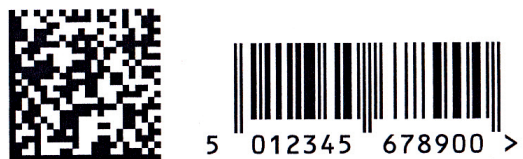
Print quality SOLID F40