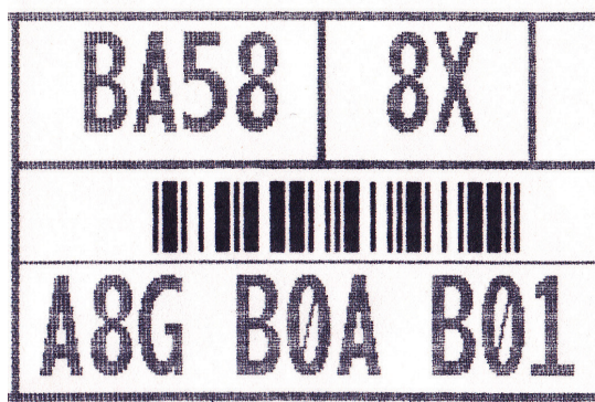
Print quality line printer

Some Microplex line matrix printer replacement products.