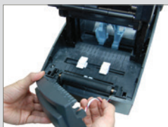
Auto-Cutter : Easy installation