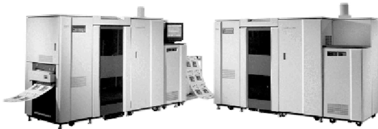
Figure 35. Infoprint 4000-IR1/IR2 and 4000-IR3/IR4 Printers

Table 134 summarizes the printer characteristics for the Infoprint 4000-IR1/IR2 and 4000-IR3/IR4 printers