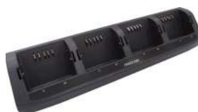
Quad 4-Battery Bay External Charger* 258234-001 Americas 258234-002 Europe 258234-003 United Kingdom