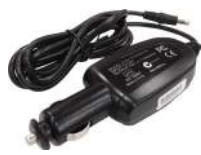
Vehicle Power Adapter 258240-001