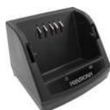
Single Bay Battery External Charger* 258314-001 Americas 258314-002 Europe 258314-003 United Kingdom