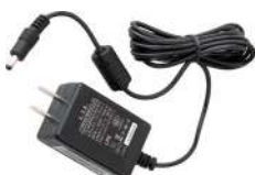
AC Single-Unit Charger* 258233-001 Americas 258233-002 Europe 258233-003 United Kingdom