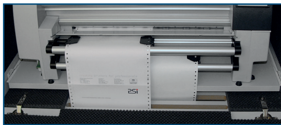
Two separate paper slots (Photo shows PP 809 into the Sound Cover)