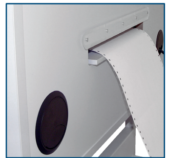
Rear side with tear-off bar